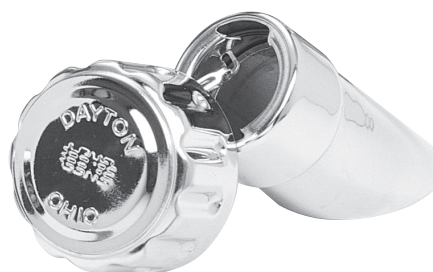
Example of Necks & Caps

See pages 1b, 2b, 3b, 16b, in Catalog FPA-09 for Cap Details.