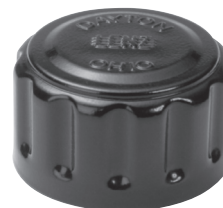
Black Powder Coated

See pages 1b, 2b, 3b, 16b, in Catalog FPA-09 for Cap Details.