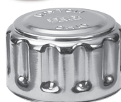
40 or 10 Micron