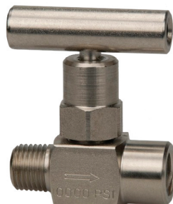
GV-4N NEEDLE VALVE