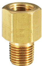
LGS GAUGE SNUBBER

Comité Européen de Normalisation (CEN) Central Secretariat rue de Stassart 36 B-1050 Brussels Belgium