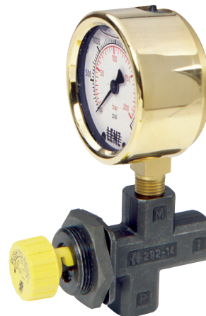
GV-4 GAUGE ISOLATOR